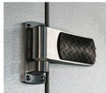
Spring Assisted Hinges

For safe use an easy-grip, glow-in-the-dark safety release is included inside the unit to prevent accidental entrapment.