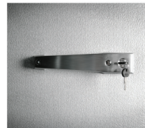
Keyed Locking Door Handle